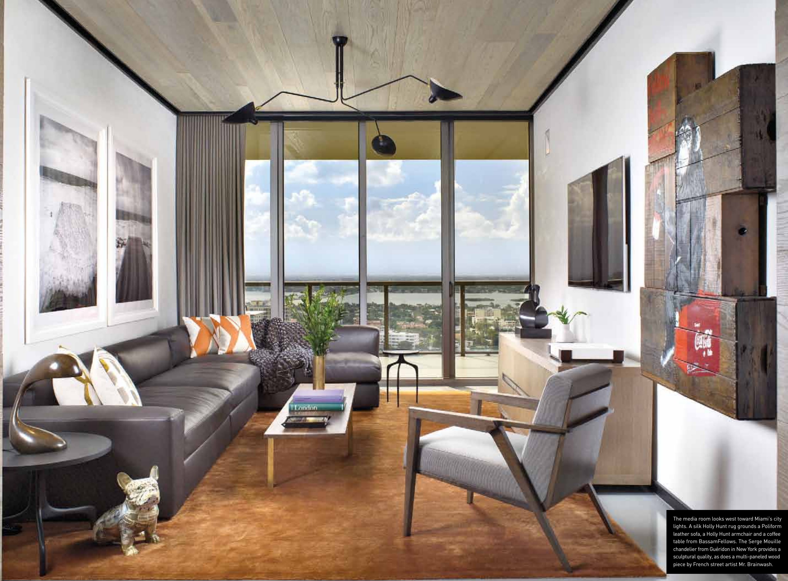
The media room looks west toward Miami's city lights. A silk Holly Hunt rug grounds a Poliform leather sofa, a Holly Hunt armchair and a coffee table from BassamFellows. The Serge Mouille chandelier from Guéridon in New York provides a sculptural quality, as does a multi-paneled wood piece by French street artist Mr. Brainwash.