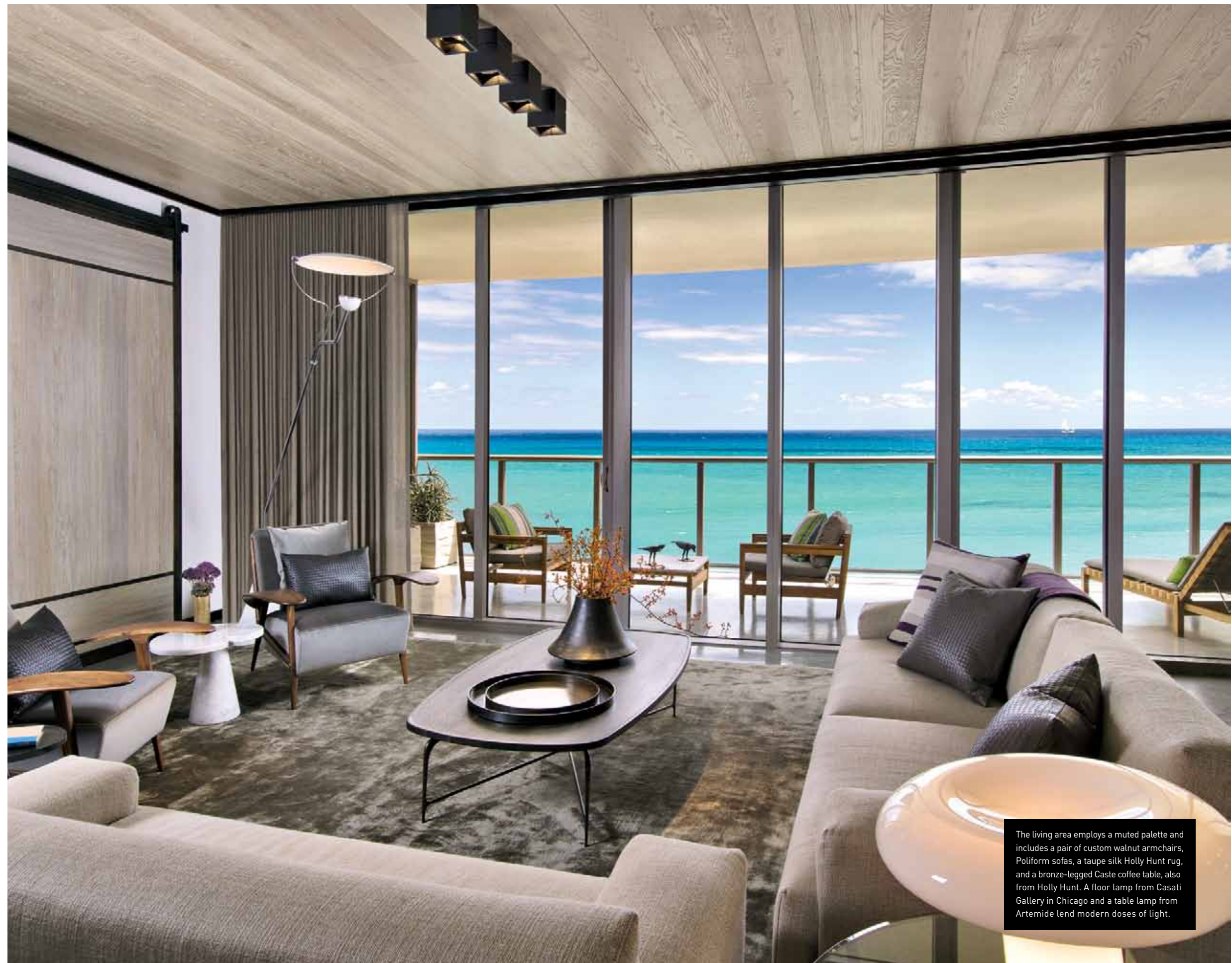
The living area employs a muted palette and includes a pair of custom walnut armchairs, Poliform sofas, a taupe silk Holly Hunt rug, and a bronze-legged Caste coffee table, also from Holly Hunt. A floor lamp from Casati Gallery in Chicago and a table lamp from Artemide lend modern doses of light.

Further inside, Hawrylewicz and Lieber made an unconventional choice given the opulent setting of the building: using industrial materials like polished concrete for the floors and raw steel for the baseboards and crown moldings. But the rugged elements work in tandem with warm woods and the exacting, seamless precision required of the construction. A door in the