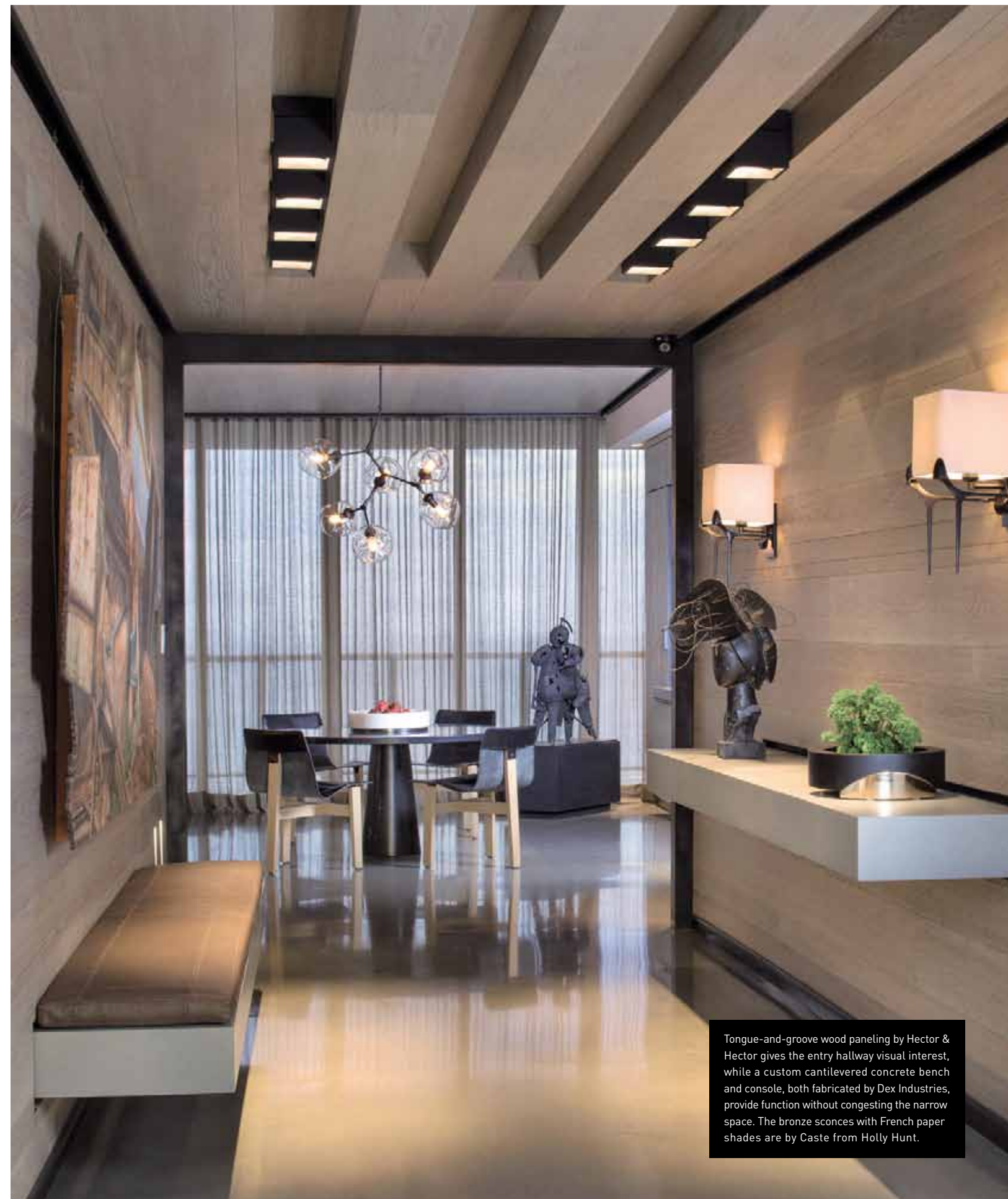
Tongue-and-groove wood paneling by Hector & Hector gives the entry hallway visual interest, while a custom cantilevered concrete bench and console, both fabricated by Dex Industries, provide function without congesting the narrow space. The bronze sconces with French paper shades are by Caste from Holly Hunt.

In the living room, for instance, comfy sand-hued sofas, custom walnut paddle-armed chairs and a dark taupe rug give off an earthy vibe. In the media room, a chocolate sofa and orange silk carpet keep things quiet and moody. Yet the kitchen, with its hand-plastered walls and bone-colored cabinetry, lends a sense of brightness, acting as a magnet for the owners